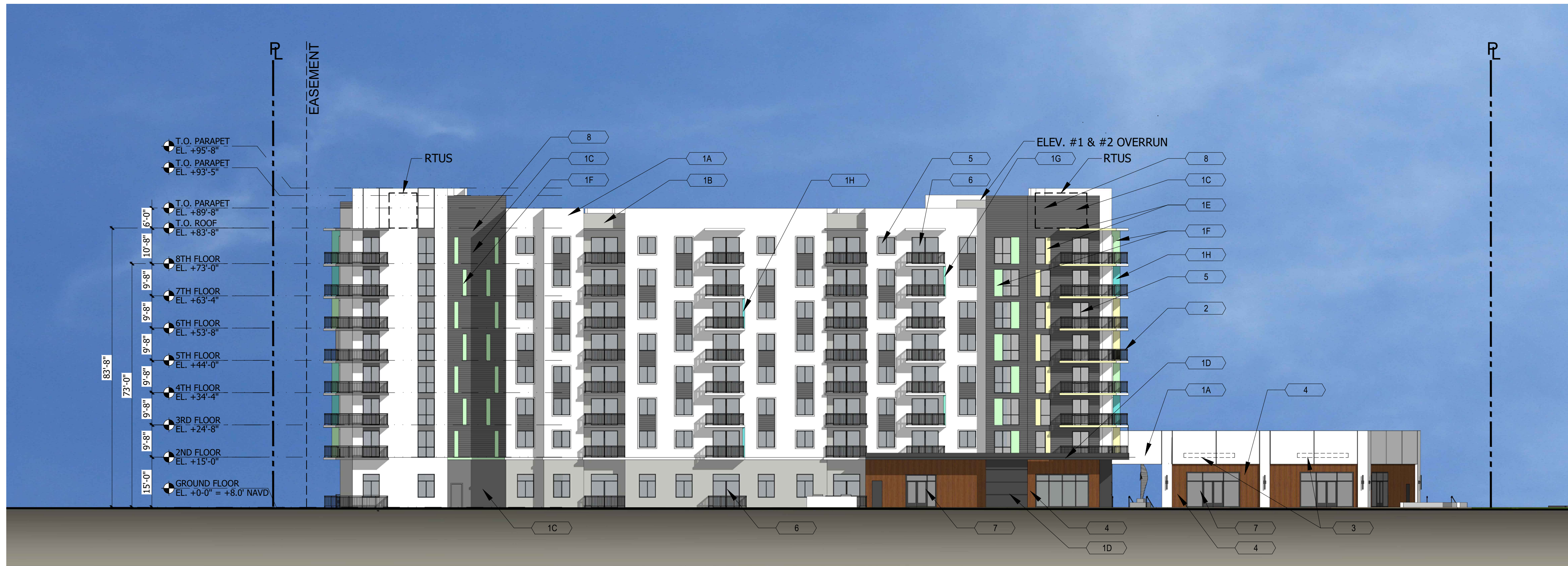
2 WEST ELEVATION A301 SCALE: 1"=20'-0"