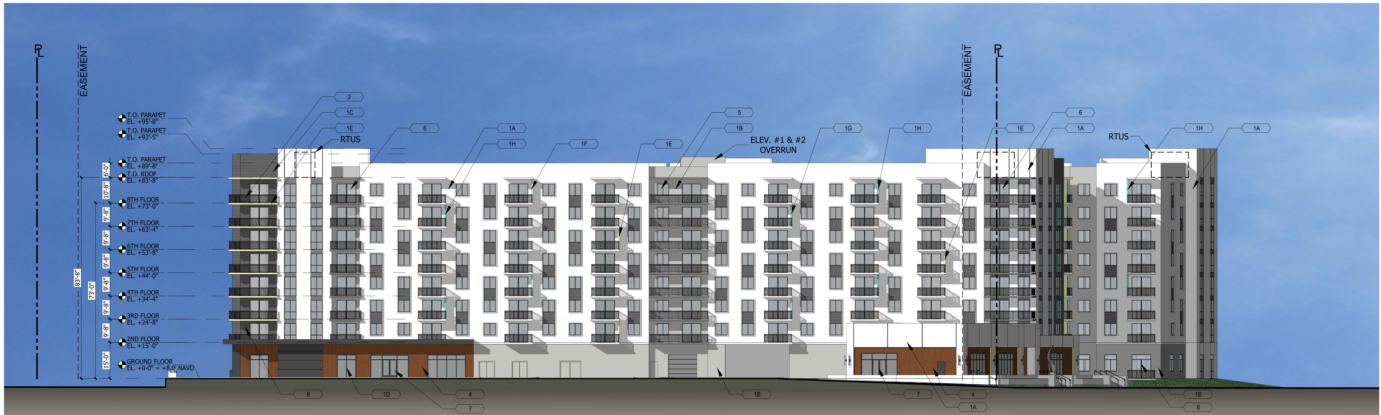
1 SOUTH ELEVATION A301 SCALE: 1"=20'-0"